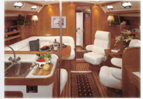
Catalina 470 Two Cabin